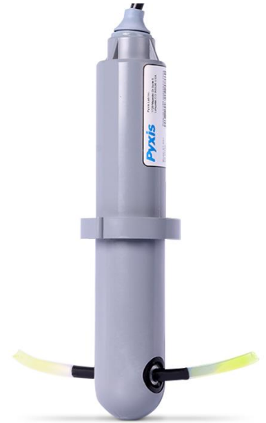
ST-600 Series Inline Sensors Above - ¼" Tube adapter installation Below - ¾" Inline Tee Installation